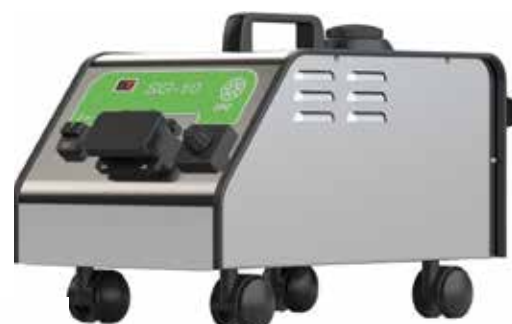
SG-10 BOILER WITH AUTO FILLING TANK